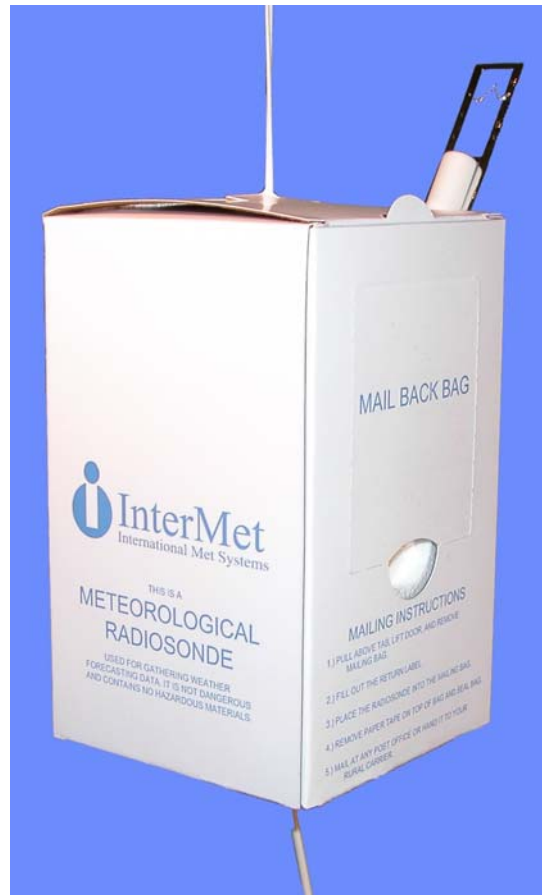
Figure 1: InterMet iMet 1 Radiosonde

user to bend the boom out to a 45 degree angle and feed the elastic string with a ring through the top of the wrapper for attachment to the balloon string. A Styrofoam door inside of the wrapper is raised to access two switches, via a hole in the wrapper, that are used to turn the power on and to set the transmitter to one of 8 frequencies in the 400.15-406 MHz range. There is no need to insert a battery pack, connect the battery pack or fill a battery with water. The mail back bag is accessible from the open flap so the user can write the launch data on the bag. A flap is provided to access the mail back bag for someone who may find the radiosonde after a flight.