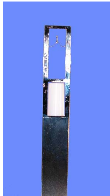
Figure 2: Temperature-Humidity Boom

The humidity sensor is a variable capacitance device. It has a polymer dielectric insulator with a permittivity that varies with relative humidity. Due to its small size it has a fast response time (2 seconds at sea level and 20 deg C). There is very little performance degradation after long-term saturation with nearly instantaneous de-saturation. There is no performance degradation after immersion and thawing.